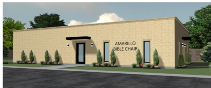
Image of new Bible Chair building